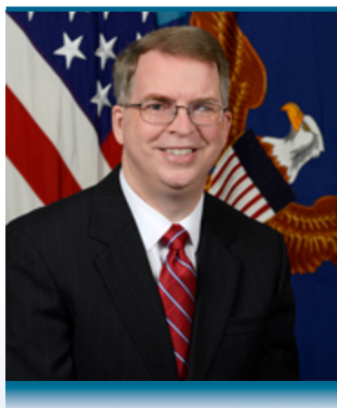
Honorable David L. Norquist

Thank you for all that you do – keep up the great work!