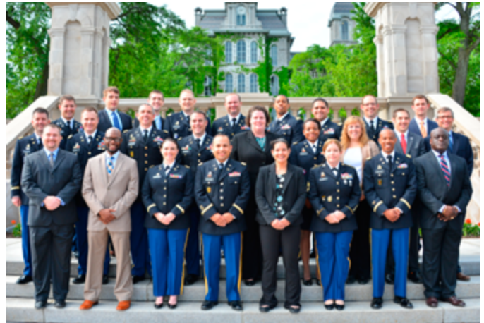
Pictured: Defense Comptroller Program Class of 2015

If you would like additional information about Syracuse University's Whitman School of Management and its course offerings or curriculum, visit https://whitman.syr.edu/programs-and-academics/programs/defense-programs/defense-programs/index.aspx .