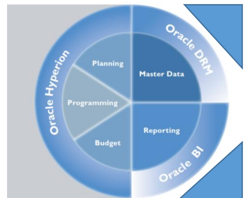
PBES – Configuration Goal

Regardless of personal preferences, PBES will provide its users with a technological and functional quantum leap forward. Just like that very first smartphone we were all so anxious to get our hands on, PBES will probably take some time getting used to as well. Once we do, we will never know how we were able to live so long without it.